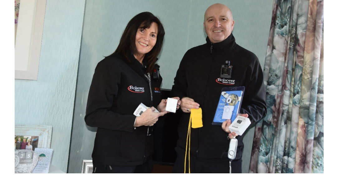
Feedback from the public

"I feel much more reassured as I work away leaving my wife alone at home"